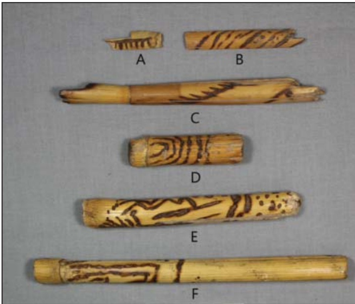
Figure 13.21. Decorated Phragmites reeds. A: Cist 5I in Room 4 (VVAC 7918); B: No provenience (VVAC 1020); C: No provenience (VVAC 0516); D: Cist 5I in Room 4 (VVAC 7917); E: Cist 5I in Room 4 (VVAC 1114); F: Cist 5I in Room 4 (VVAC 1386)

The longest decorated reed is 17.8 cm in length and 1.3 cm in diameter (Figures 13.21f and 13.22b). It has a worn area below the node where it appears to have been suspended by a cord. The geometric design consists of meandering lines and two “X” figures adjacent to the lines; these may represent birds, stars, or are just abstract elements.