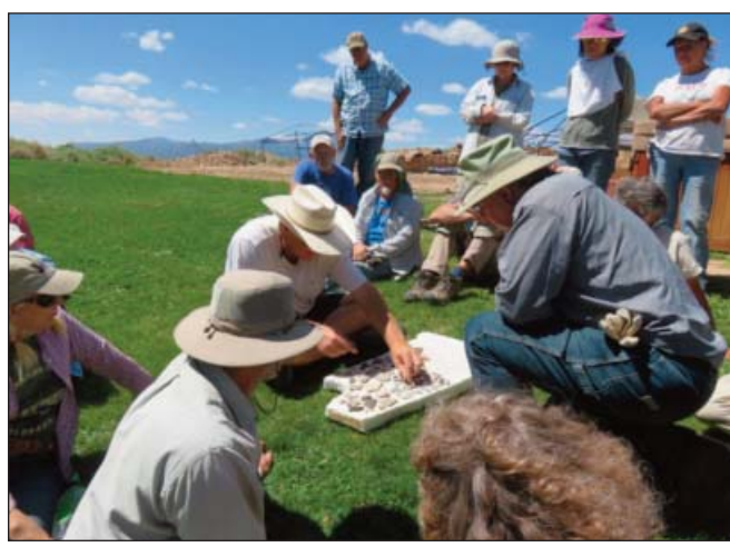
Learning about the ceramics that came from some of the excavation units at Mitchell Springs

The Center has been excavating in the Colorado sites for over eight years and plans are in the works for continuing next year so that more of our members will have a chance to experience field archaeology.