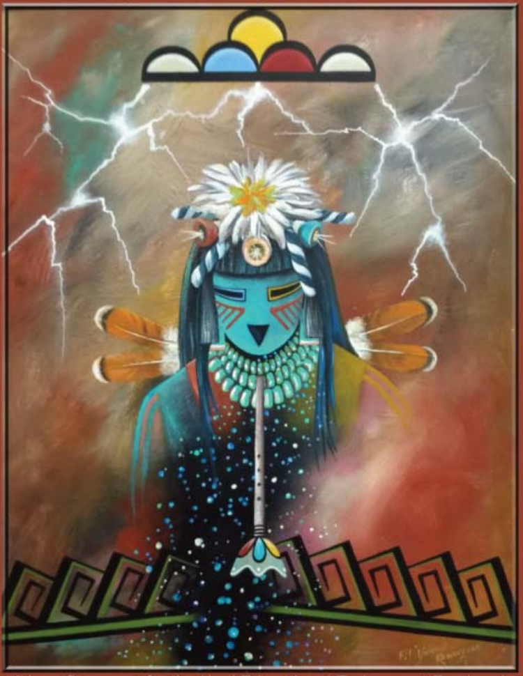
A benefit concert for the Hopi Educational Endowment Fund and the Verde Valley Archaeology Center Capital Campaign