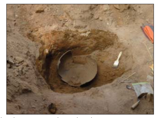
One member of the field school uncovers a large bowl